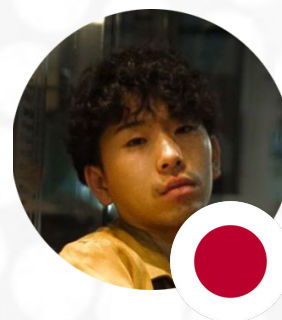
JUDGE KOSUKE TAKAHASHI